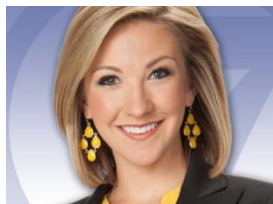
2013 JVM Journalism Award

Performers: UMOJA Step Team, Azusa Pacific University